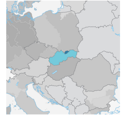
Water bodies with less than good ecological status in Slovakia