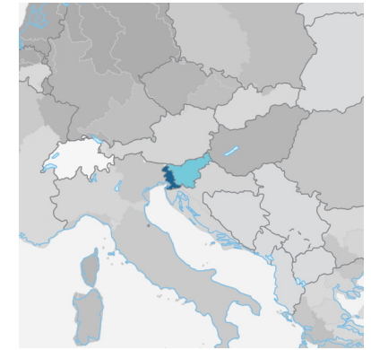
Water bodies with less than good ecological status in Slovenia