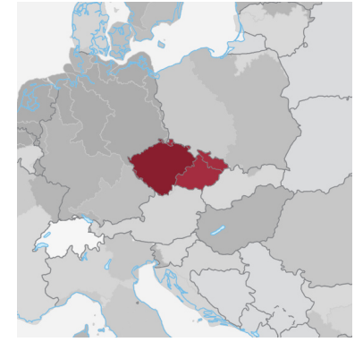
Water bodies with less than good ecological status in Czech Republic