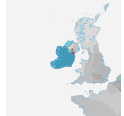
Water bodies with less than good ecological status in Ireland - Source: EEA (2021)